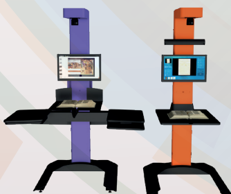
EXAMPLES OF WALK-UP CONFIGURATION, KIOSK FOR SELF-SERVICE USE