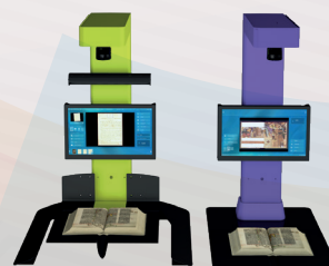
EXAMPLES OF TABLE TOP CONFIGURATION, TO BE INSTALLED ON YOUR OWN TABLE