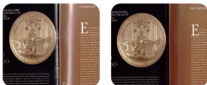
Glare control system